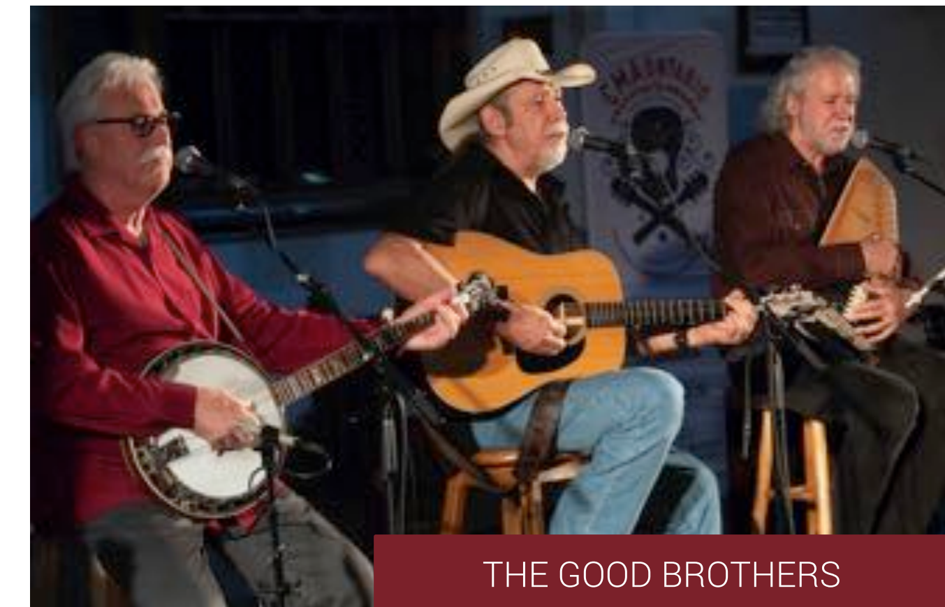
THE GOOD BROTHERS